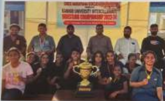
Judo men and women champions