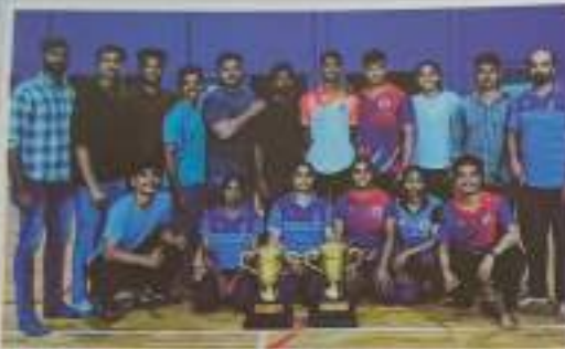
Judo men and women champions