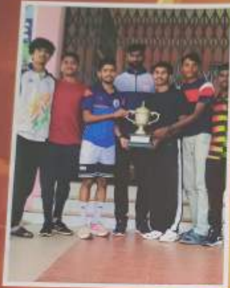
Cross country men runner up