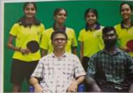
Women Table tennis champions