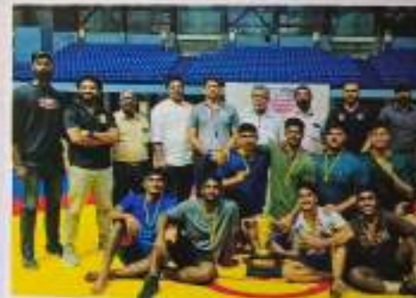
Women Table tennis champions