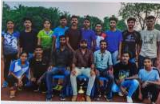
Athletics Men 2nd runner up