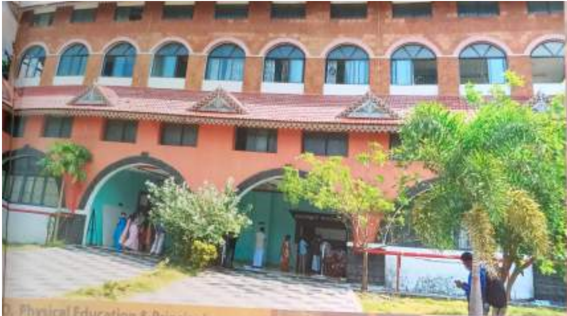
(Dr. Physical Education & Principal, S N College, Kannur ) on the occasion of Sports Merit Award Function 2024