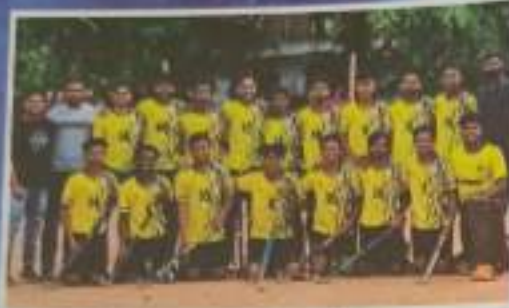
Hockey men champions