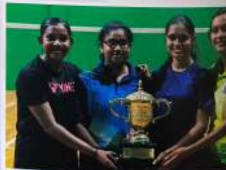
Badminton Women Runner up