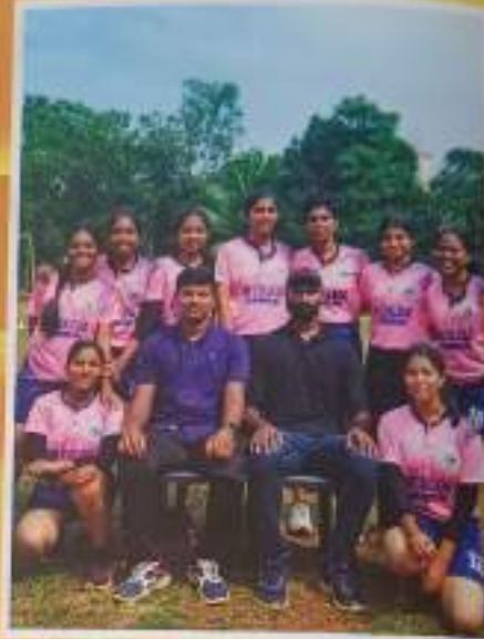
Women ballbadminton 3rd position