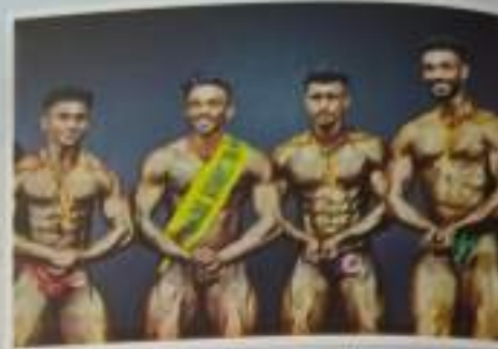
Best physique champions